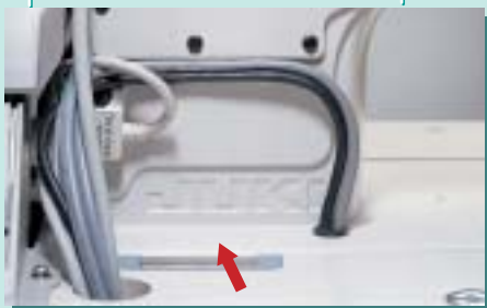
Embossed JUKI mark

● To order, please contact your nearest JUKI distributor.